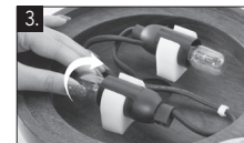
3. Twist the bulb counterclockwise and pull the bulb in the direction of arrow. Do not insert any instrument in the holder.