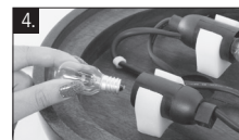
4. Take the new bulb and insert in the holder.