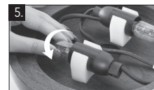
5. Gently twist bulb clockwise as indicated with arrow.