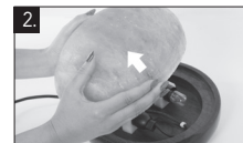
2. Remove salt dome from base by lifting. Set aside.