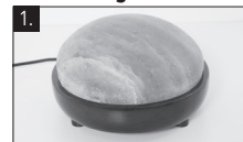
1. Unplug the Salt Dome.